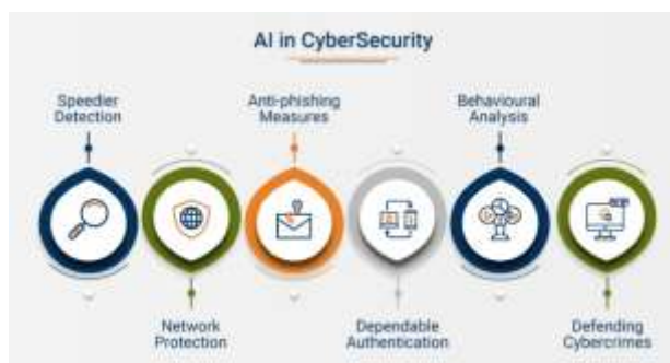
Figure 1:[Source :

The integration of machine learning (ML) and artificial intelligence (AI) in cybersecurity has demonstrated significant potential in improving detection mechanisms. This study explores how predictive analytics can be used to enhance detection accuracy and minimize false positives.